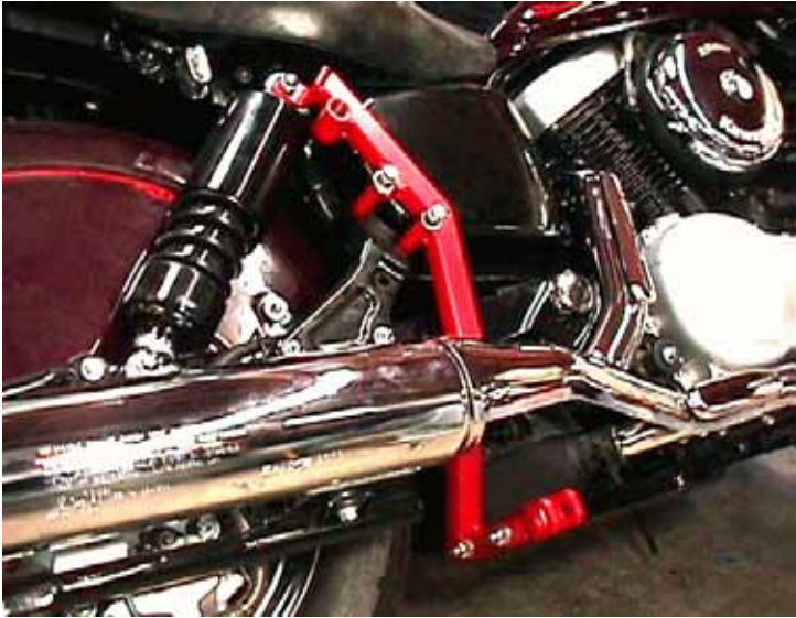
Rear mount Kawasaki Vulcan Nomad