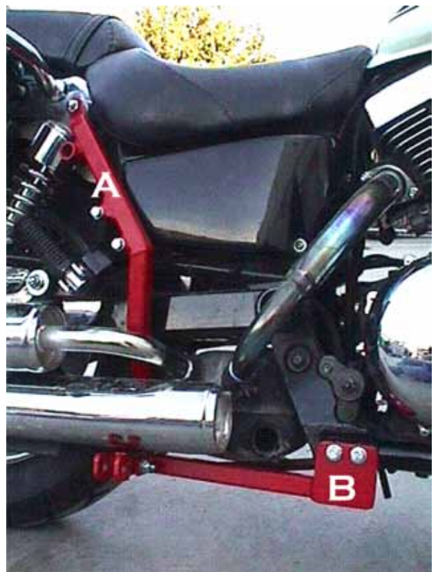
(Figure 1-B Rear Sub Frame A & B) Vulcan Classic