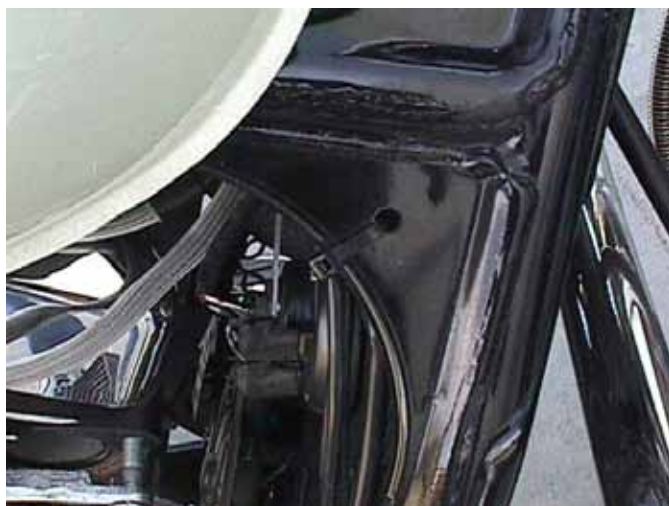
(Figure 2-A Upper Frt.)