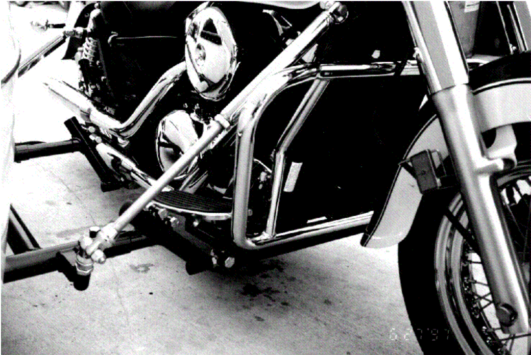
Photo showing hardware configuration