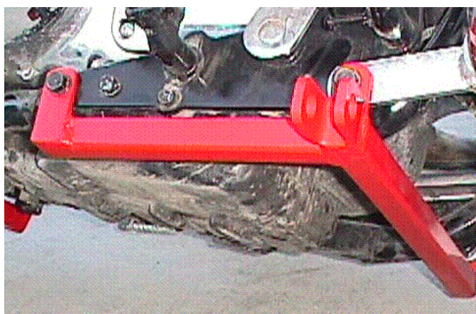
(Figure 3-A Lower Frt.)