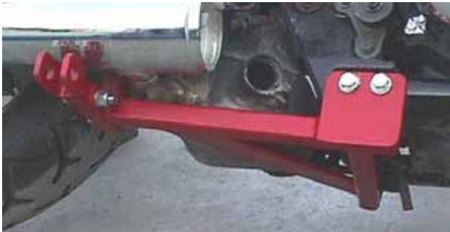
(Figure 1-A Part B Sub Frame)