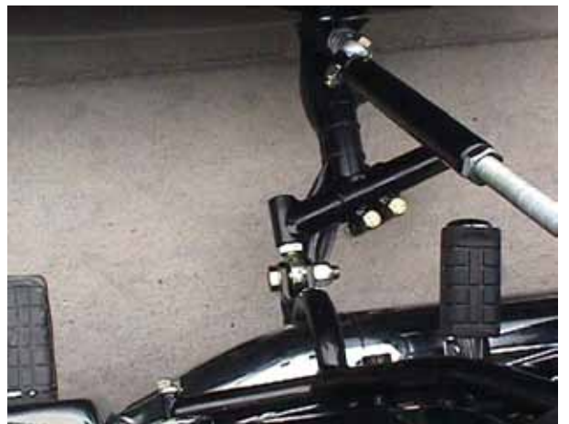
Figure 5) Showing rear hardware from sidecar to upper and lower mount position.

(Figure 4) Showing front hardware location from sidecar to lower and upper mount position.